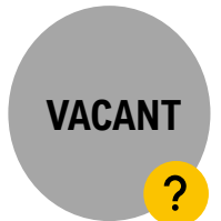
Regional Specialist Group Liaison: Vacant