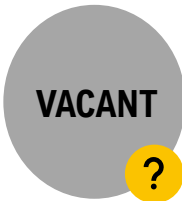
Committee Member: Vacant